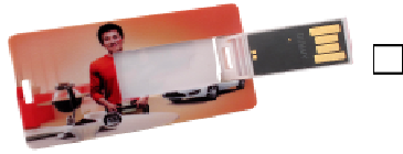
CD06 Compact Sized Card Drive

2 Color 1 location Pad print on the CD06