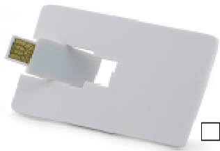
CD04 Full Sized Card Drive

2 Color 1 location Pad print on the CD04